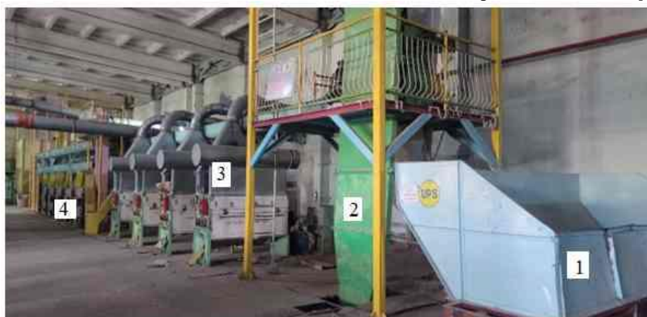
FIGURE 3. 1LB Two-stage lint removal system with linter without combustor

During the test work, hairy seed seeds with the same quality indicators were distributed to the compared delinters using seed augers installed on the upper shaft of the delinters. The tests used seeds of the Namangan-77 selection variety with a hairiness of 8.6%, moisture content of 8.2%, and mechanical damage to the seeds of 3.2%.[8]