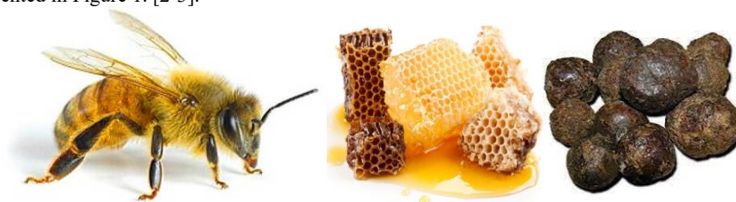
FIGURE 1. Bees and natural propolis

Propolis is a term derived from two Greek words: pro "in front" and polis "community" or "city", and means to protect the hive. Honey bees produce propolis from several parts (twigs, flowers, pollen, and buds) collected from various plant sources and with the addition of modified salivary secretions, wax, and pollen in the hive. In particular, its antimicrobial and antioxidant activity has important applications in the field of propolis, it is used as a raw material in the production of drugs and as a food additive in the pharmaceutical industry. An overview of bees and propolis is presented in Figure 1. [2-3].