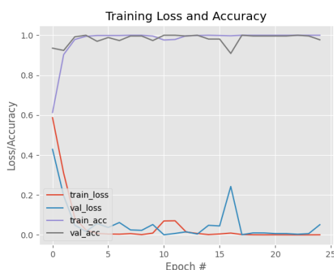
Figure 3: LOSS AND ACCURACY FOR TRAINING AND VALIDATION

The graph above shows the training loss and accuracy along with Validation loss and accuracy. Model is trained for 25 epochs on CT scan images for lung disease detection. From the plot, we observe that both training and validation losses drop sharply within the first few epochs and then remain very low, indicating that the model is able to learn feature distinguishing quickly. The training and validation accuracies rise rapidly and stay consistently high after the initial epochs resulting in excellent model performance. The minimal gap between training and validation metrics implies that the model generalizes well and does not overfit to the training data. The fluctuations in validation loss are likely due to a small or noisy validation set, which can cause variability even when the model is performing well. Overall, this training performance suggests a highly accurate model for detecting lung diseases from CT scans.